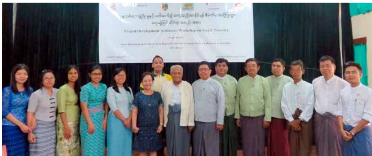
Participants of the ASRF meeting in Myanmar held on 8-10 August 2017.