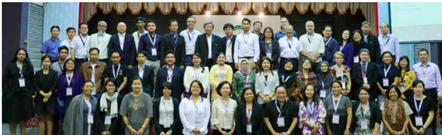
Participants during the last day of the workshop led by Dr. Saguiguit.

The workshop uncovered the absence of a clear and adequate articulation of agrobiodiversity in existing regional and national policy frameworks and programs that deal with agriculture or biodiversity despite its essential links to food systems and nutrition and its importance in enhancing local livelihoods.