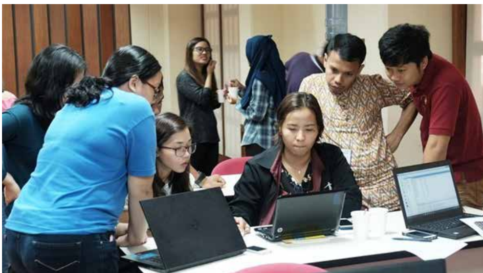
The participants work on their crop models in small groups.

The course discussed the principles and approaches of crop modeling and its application for risk and impact assessments. It also covered the use of the empirical approach for estimating crop production. On the other hand, the effects of soil, weather, and management on crop production were studied using the dynamical approach. The discussions focused on capabilities and limitations of each approach and some considerations for their use.