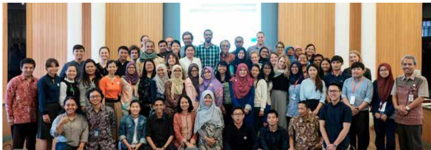
Participants, resource persons, and organizers of the Sustainability Transitions Summer School.

Twenty-eight years since launching the UC, SEARCA continues its active role in the consortium, which it sees as a viable approach to pursuing agricultural human resource development in Southeast Asia through free exchange of information, facilities, and expertise; offering of dissertation doctorate and dual degree scholarships; and a joint MS degree program to push internationalization of higher education institutions in Southeast Asia. (Report from CJVEnables)