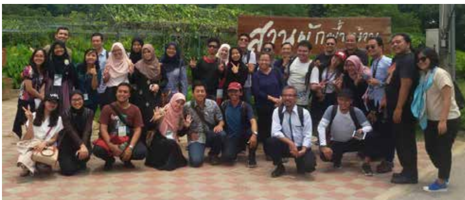
The 3rd UC Graduate Forum participants.

The Graduate Forum is an annual activity of the UC, hosted by member universities on rotational basis. This year’s graduate forum saw paper presentations from seven students of Universiti Putra Malaysia (UPM), six from the University of the Philippines Los Baños (UPLB), six from Institut Pertanian