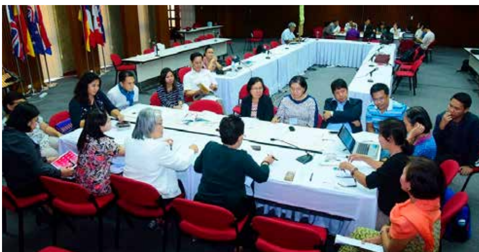
Participants work on the action plan focused on agricultural transformation, market integration, trade, and value chains.