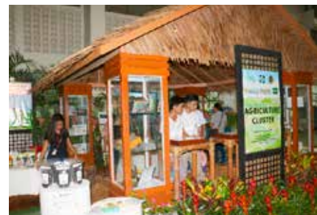
SEARCA's display materials at the Wonderama were part of the Agriculture Cluster exhibition.

is the LBSC “science ecotourism,” and that it will highlight, as one of the major destinations, the Southeast Asian AgriMuseum and Learning Center to be built by SEARCA. (LLDDomingo)