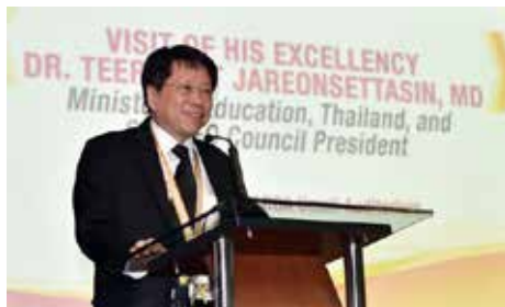
Minister Teerakiat Jareonsettasin delivers his message during his visit to SEARCA on 19 April 2017.