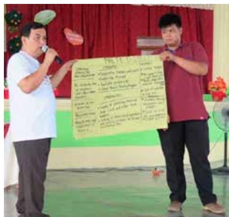
Participants from the school district of Paete, Laguna present their Strategic SWOT Analysis.

“When I was principal of Labuin Elementary School in Pila, a pilot school of the project, I was very fortunate to have attended the series