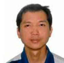
SAW HTO LWE HTOO