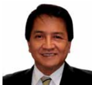
Dr. Cielito F. Habito

an international refereed journal dedicated to the publication of information and analysis on topics within the broad scope of agriculture and development.