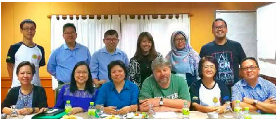
The ASRF PSC members and resource persons during the meeting in Chiang Mai, Thailand.

The pilot phase of the ASRF commenced in April 2014 and operated for 35 months until February 2017. During the pilot phase, 19 projects were approved and implemented in eight AMS, namely: Cambodia, Indonesia, Lao PDR, Malaysia, Myanmar, the Philippines, Thailand, and Vietnam.