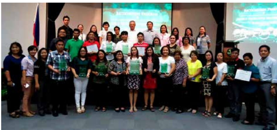
Awardees of the School and Home Gardens Project.