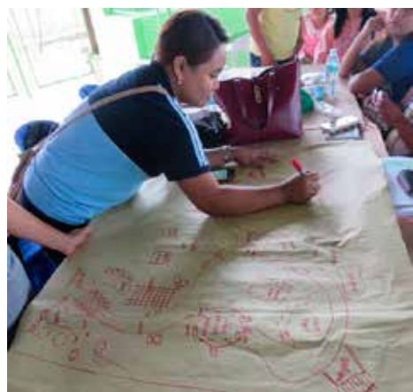
Participants from the school district of Sta. Cruz prepare their school garden layout.

of workshops and trainings conducted by SEARCA, DepEd, and UPLB. When I transferred to Bagumbayan, I made sure to apply the knowledge and skills I gained from the project,” she said.