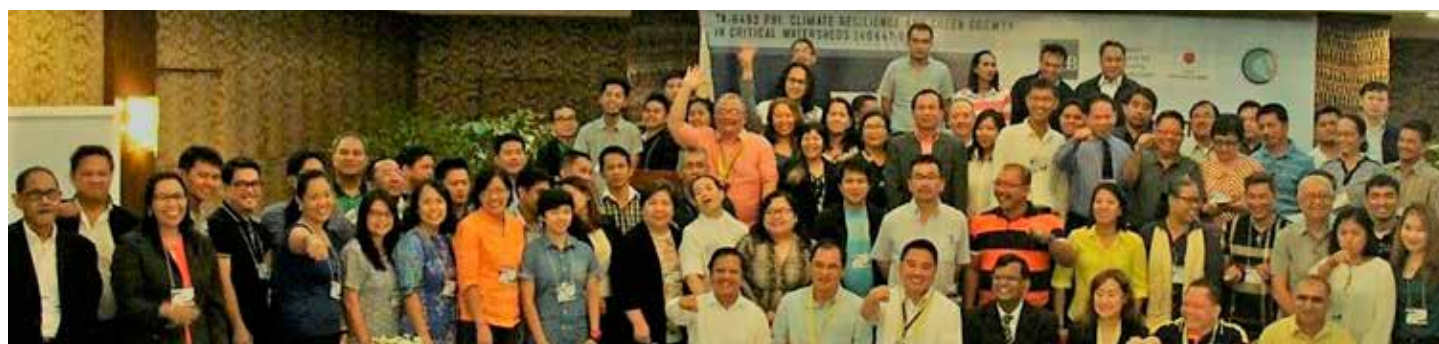
Delegates to the conference representing local government units, national government agencies, private sector, academe, nongovernmental and people’s organizations, and development partners.

He emphasized that “agriculture remains to be the driver of Mindanao’s development and a major backbone of the Philippine economy, and our best option against this challenge is to adapt and heighten the resiliency of agriculture to the effects of climate change.”