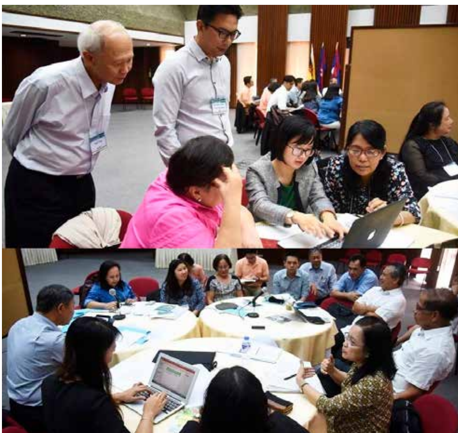
Group breakout sessions

To analyze the implications of a changing regional trade regime on a country’s food stocks and the impacts of individual countries’ food reserves on regional stockpiling mechanisms, the participants were split into two groups during the breakout session. The groups came up with