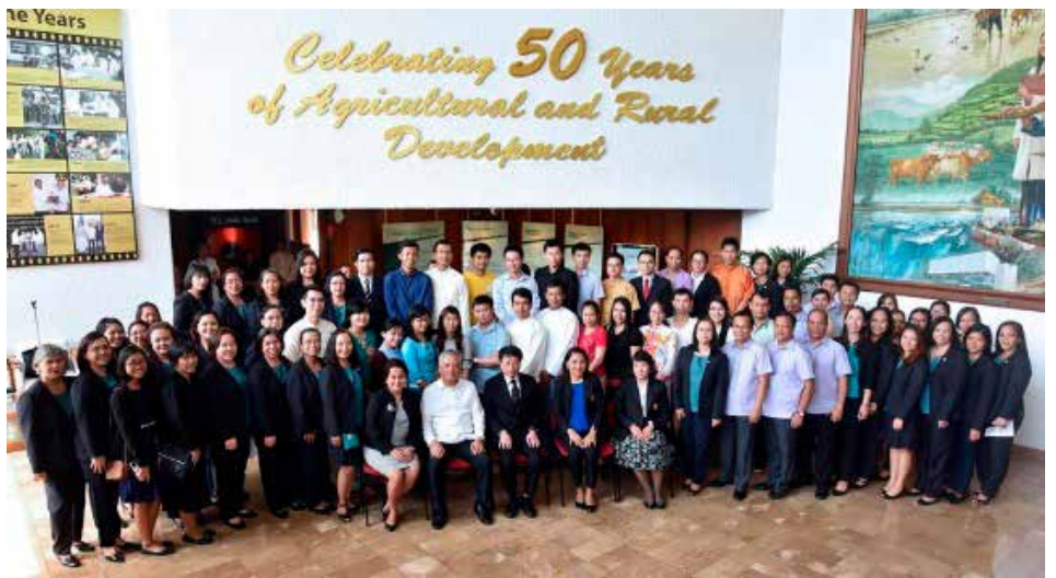
The SEARCA officers, staff, and scholars with the Thai Education Minister Teerakiat Jareonsettasin (seated, center), concurrent president of the Southeast Asian Ministers of Education Organization (SEAMEO) Council, and other guests.

RE-ENTERED AS SECOND CLASS MAIL At College Post Office, Laguna. Under Permit No. 2012-22 on 29 March 2017