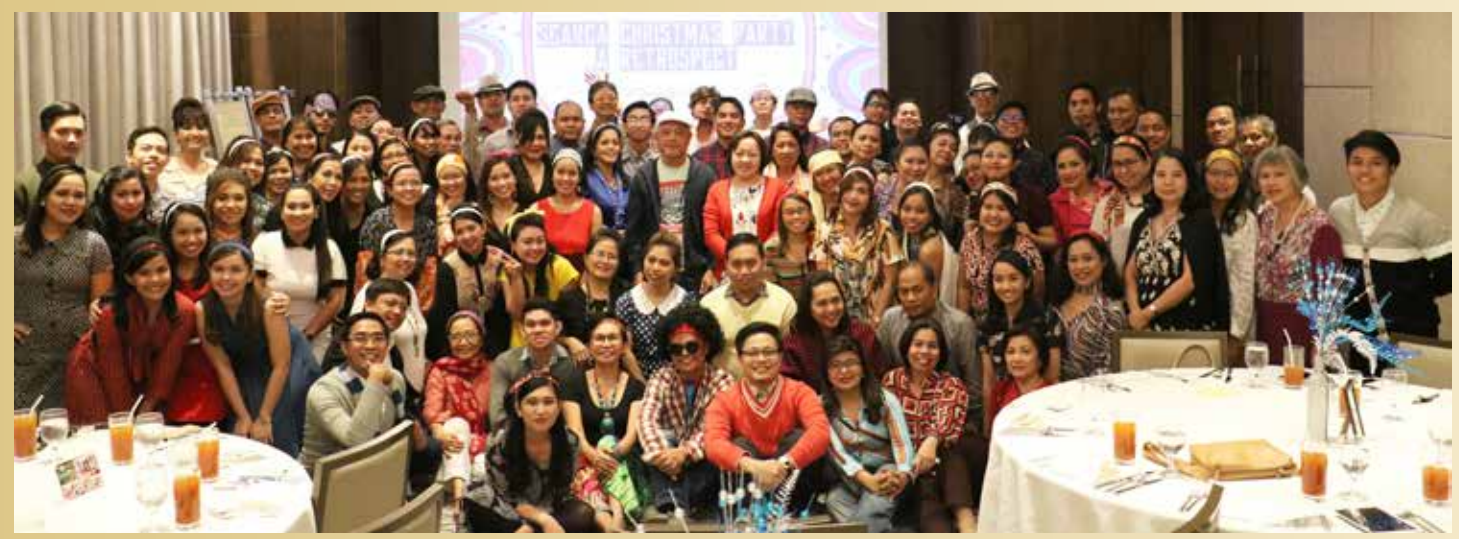
YULETIDE CELEBRATION. The 60s and 70s fashion were all the rage at the SEARCA Christmas Party: In Retrospect held on 16 December 2016 at Somerset Alabang in Muntinlupa City, Philippines.