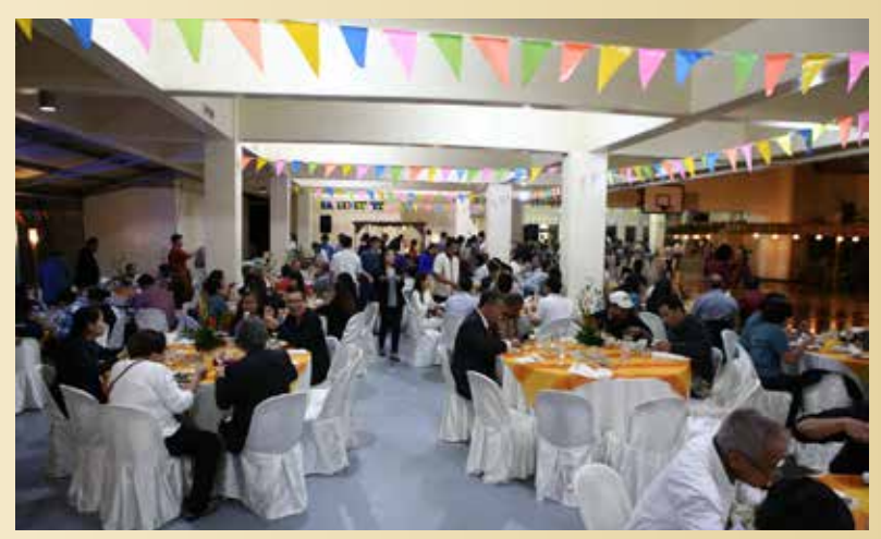
Former and present SEARCA staff and scholars partake of the sumptuous dinner celebrating the Center's golden anniversary.