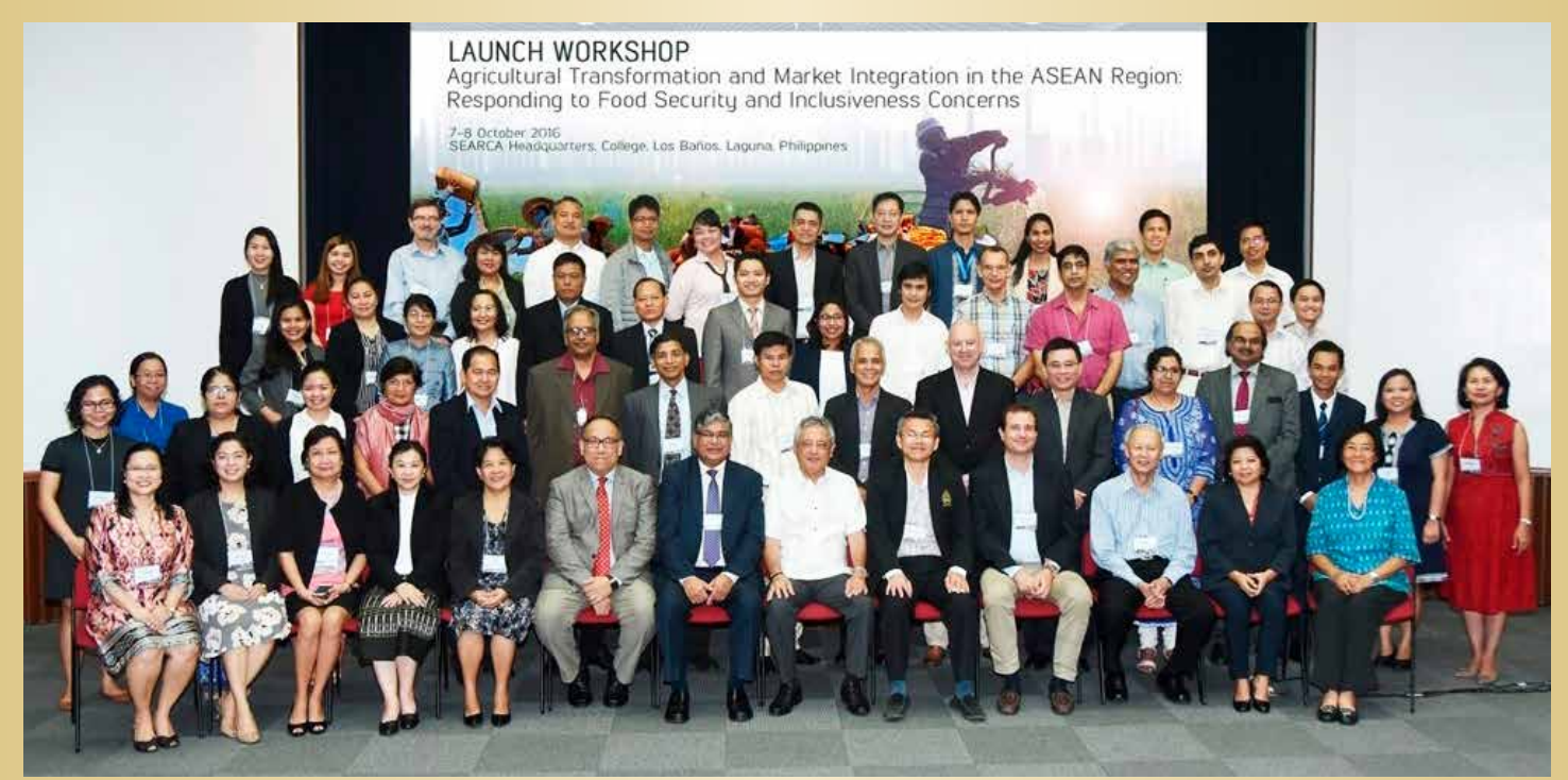
Participants, resource persons, and organizers of the launch workshop