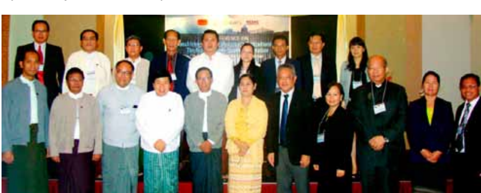
Myanmar high officials who attended the opening ceremony together with the conference organizers, resource persons, and some participants.

RE-ENTERED AS SECOND CLASS MAIL At College Post Office, Laguna. Under Permit No. 2012-22 on 29 March 2013