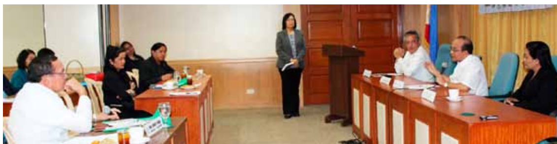
Resource persons and policymakers discuss the prospects of biotech products and research in the country during the open forum of the seminar.