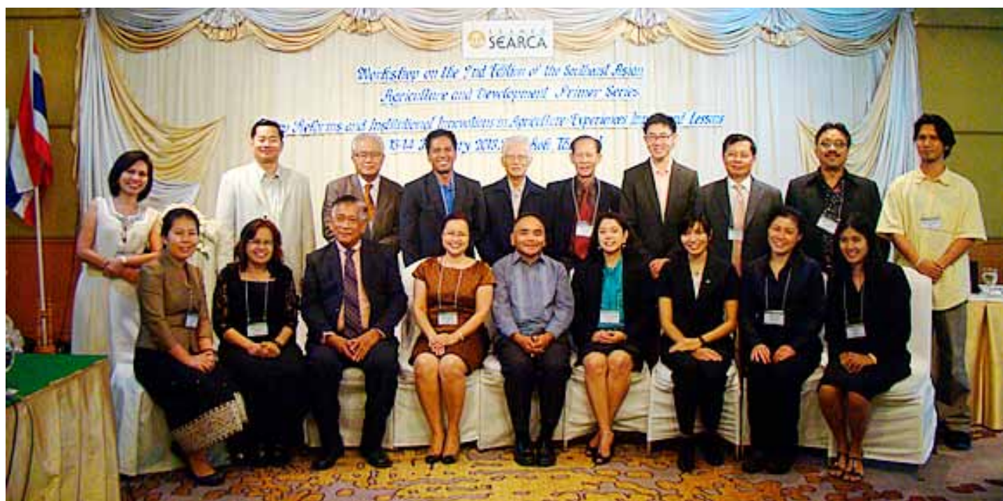
Participants and organizers of the workshop on the 2nd Edition of the Southeast Asian Agriculture and Development Primer (SAADP) Series held on 13-14 February 2013 at Jasmine Executive Suites Hotel in Bangkok, Thailand.

The workshop was spearheaded by SEARCA's Research and Development Department, which also coordinates the publication of the primer series.