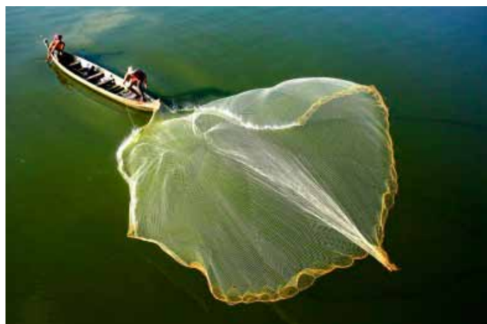
People’s Choice, Than Htike Soe