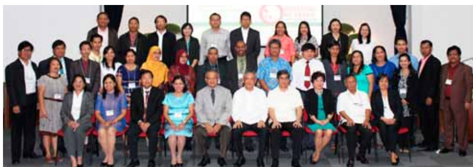
Participants, resource persons, and organizers of the SEARCA-DAAD Alumni Associations Regional Consultative Workshop held on 28-29 May 2013 at SEARCA.

RE-ENTERED AS SECOND CLASS MAIL At College Post Office, Laguna. Under Permit No. 2012-22 on 29 March 2013