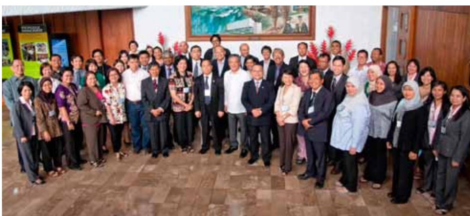
Participants of the training-workshop pose for a souvenir photo together with the Training-Workshop Management Group.