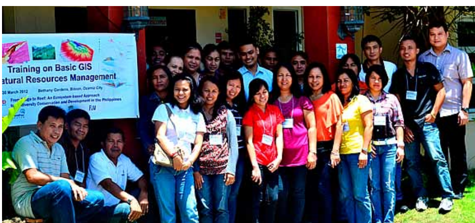
The training participants and the resource persons and organizers pose for a souvenir photo.

The unique features and status of Mt. Malindang make it a strategic site for piloting and modifying biodiversity conservation measures. Latest of this is Ridge to Reef: An Ecosystem-based Approach to Biodiversity Conservation and Development in the Philippines, a two-year study implemented starting February 2011 by three international organizations with funding from the United States Agency for International Development (USAID). These organizations are WorldFish Center, World Agroforestry Center, and SEARCA.