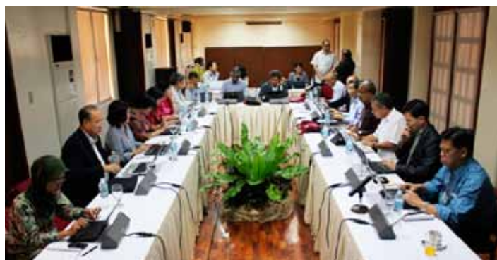
The Center Directors and their representatives prepare for the workshop session on identifying the basic elements of a SEAMEO Knowledge Management System strategy and program.