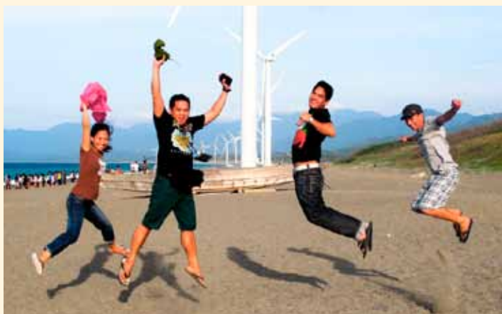
Bangui Windmills, Ilocos Norte