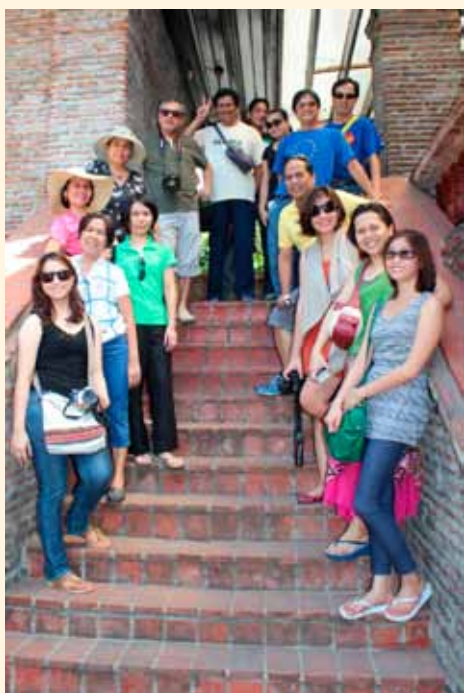
Ancestral home of world-renowned Filipino painter Juan Luna in Badoc, Ilocos Norte