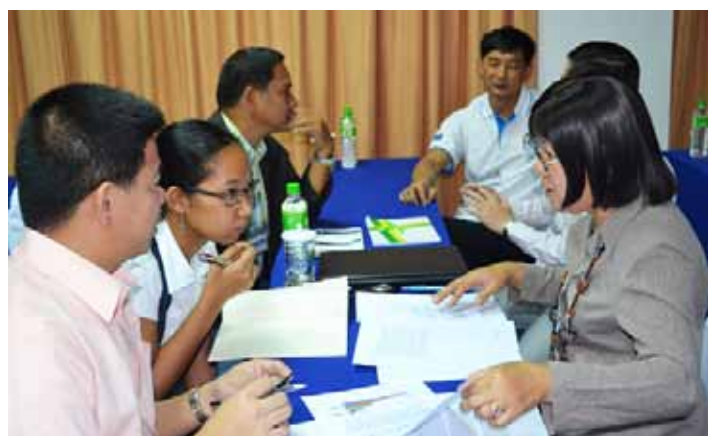
Participants work on their draft climate change adaptation plans for possible submission to funding agencies.