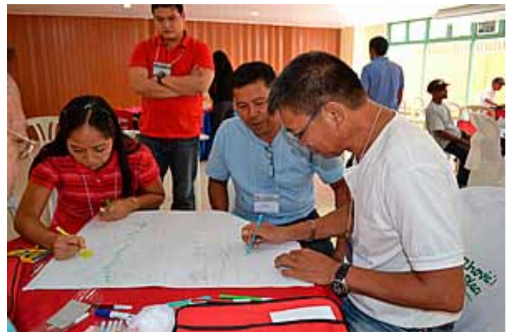
Resource mapping helped the participants in visualizing the interconnectedness of the different ecosystems found in the watershed and how materials are transferred from the upstream to the downstream communities

An action planning workshop was also conducted to identify the strategies to address sustainability issues in watershed management. The management recommendations included strict enforcement of laws (i.e., Executive Order 23 or the logging ban in natural and residual forests and Republic Act 9003 or the ecological solid waste management); promotion of organic farming; restriction of quarrying; land classification and regulation of migrants; establishment of material recovery facility; provision of alternative livelihood