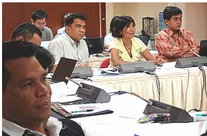
Timorese, Filipino and Indonesian university administrators listen to a lecture on current trends and challenges in agriculture and development.