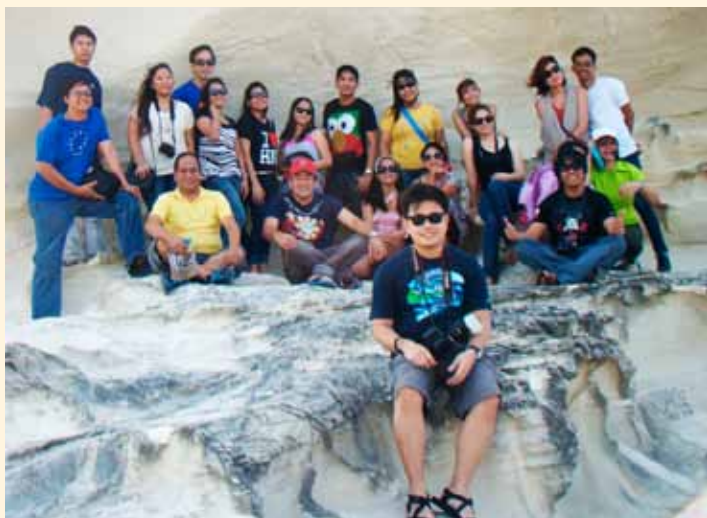
Kapurpurawan Rock Formation, Ilocos Norte

ROAD TRIP TO NORTHERN LUZON, PHILIPPINES: LAOAG, PAGUDPUD, VIGAN, AND BAGUIO