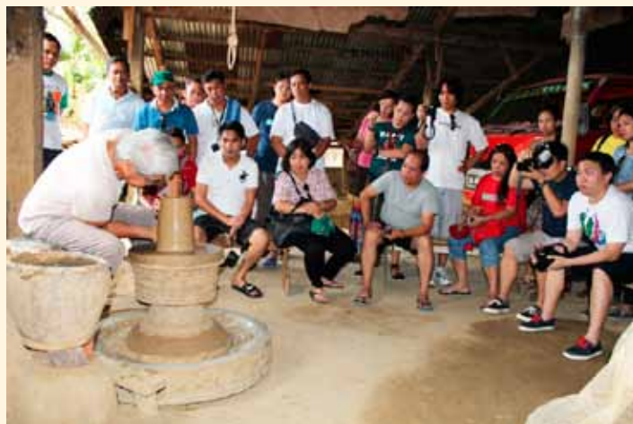
Burnayan (Pottery) Workshop, Vigan, Ilocos Sur