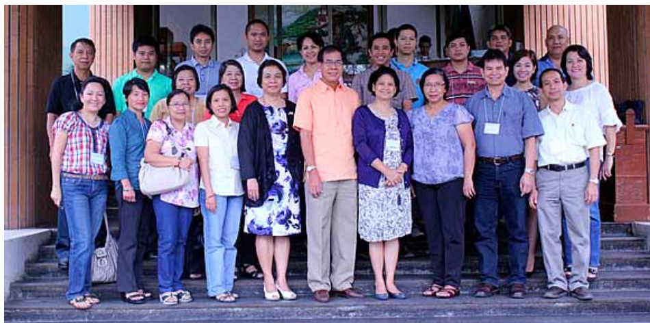
Participants, resource persons, and organizers of the training course pose for a souvenir photo.

Thirty climate change adaptation enthusiasts from the academe, local government units, and national research institutions in the Philippines, including representatives from the Philippine