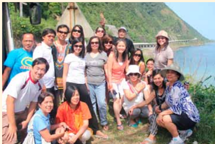
Patapat Viaduct, Pagudpud, Ilocos Norte