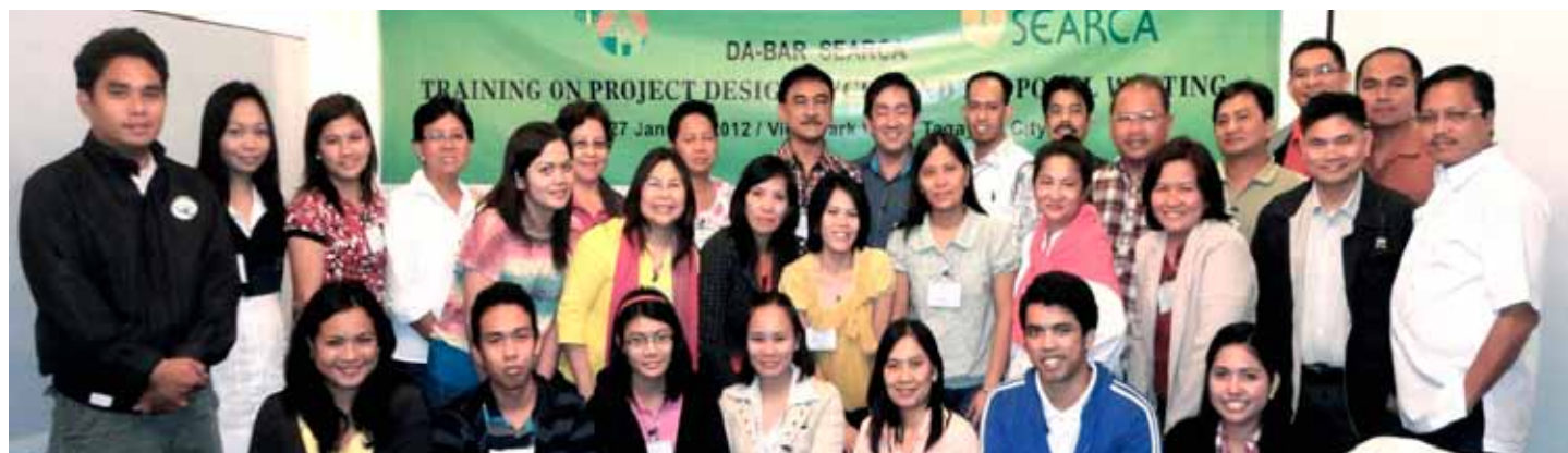
The training resource persons and organizers pose for a photo with the participants composed of DA-BAR researchers from Regions IVA-CALABARZON, IVB-MIMAROPA, and V-Bicol.

Twenty researchers from various units of the Department of Agriculture-Bureau of Agricultural Research (DA-BAR) convened in View Park Hotel, Tagaytay City on 24-27 January 2012 to participate in the first of a series of training courses on “Project Design Cycle and Proposal Writing” jointly organized by DA-BAR and SEARCA. The training course series aims to identify and prioritize projects that fit the Agriculture and Fisheries Modernization Act (AFMA), Agri-Pinoy Framework, and the Bureau’s corporate plan.