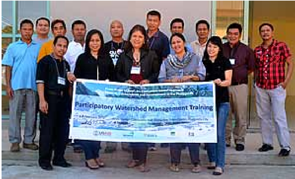
The participants, resource person, and training management team of the Participatory Watershed Management Training held on 6 - 8 February 2012 in Oroquieta City, Philippines.

“Let us continue what our government aims to do to improve our watershed... and be counted in doing this...”