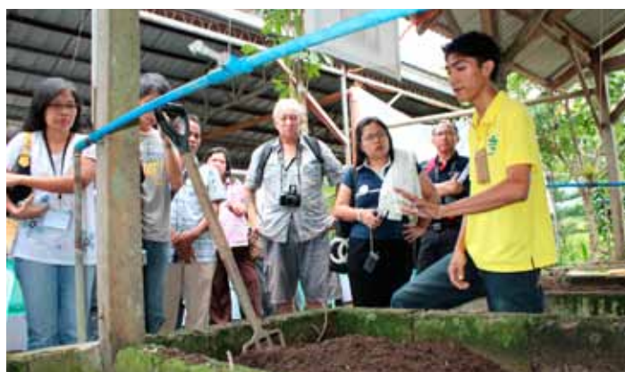
A tour guide at Costales Nature Farm in Majayjay, Laguna, Philippines explains to conference participants how earthworms are cared for in vermiculture during their agritour on 28 June 2012.