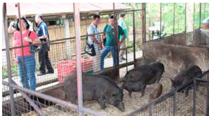
Conference participants observe native boar bred in captivity at the Costales Nature Farm during their agritour on 28 June 2012.