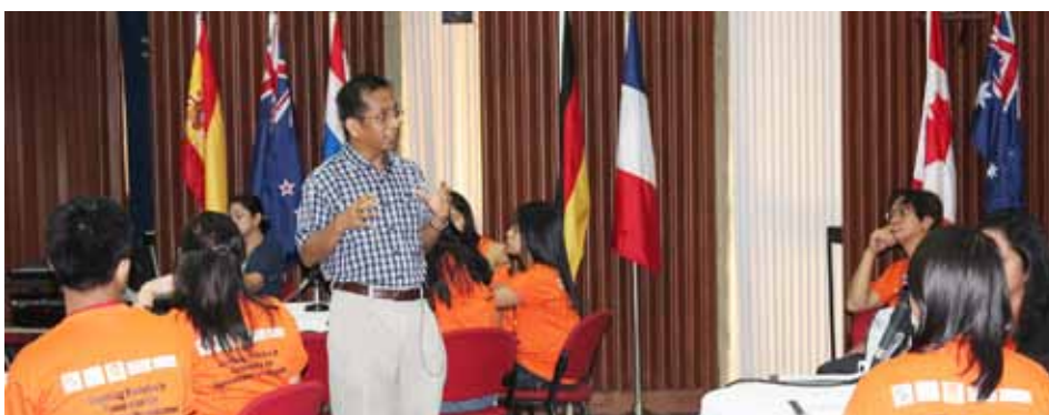
The first module was presented by high-caliber resource persons including the newly-appointed Socioeconomic Planning Secretary and Director-General of the National Economic Development Authority Dr. Arsenio M. Balisacan (standing), who is a SEARCA graduate alumnus and former SEARCA Director.

by SEARCA. Each module consists of lectures, hands-on exercises, group work, and ample opportunities for interaction among resource persons and participants.