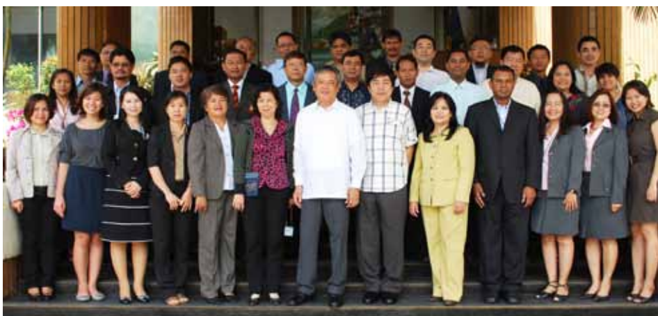
The participants and organizers of SEARCA’s Sixth Executive Forum on Natural Resource Management: Water and Food in a Changing Environment .

The forum’s emphases were on science and advocacy, knowledge transfer and mainstreaming, and science-to-policy convergence for environment, efficient water, and food production. As such, the resource persons focused their presentations on three sub-themes, namely: “Current Knowledge on Global Environment Change (GEC) Issues and Its Implications on