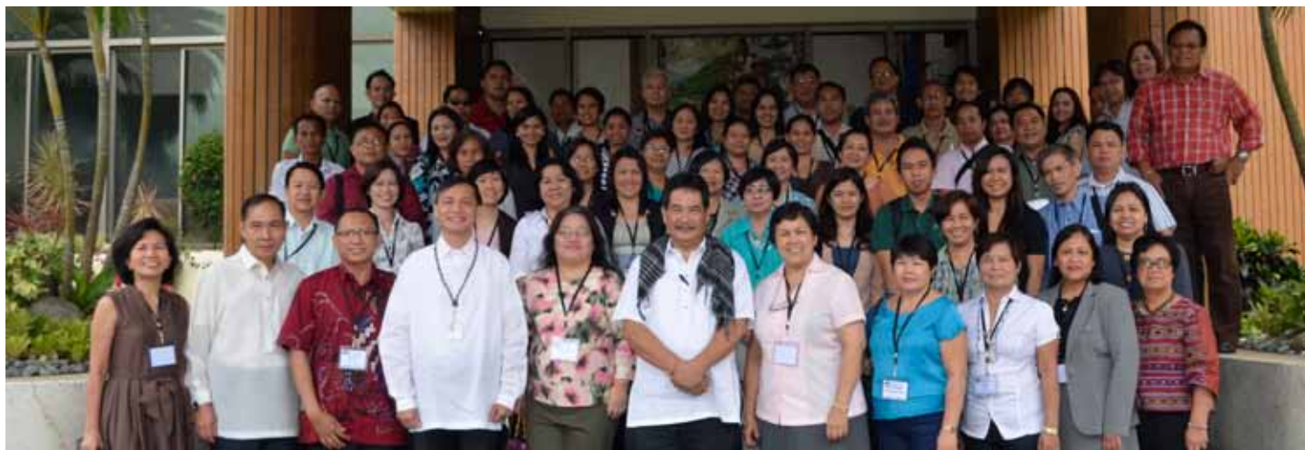
The participants, organizers, and guests of the First National Agritourism Research Conference in the Philippines.

Regulations of the Department of Agriculture, Philippines and SEARCA graduate alumnus, in his keynote address during the opening program.