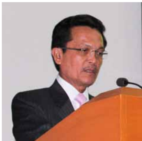
H.E. Pehin Abu Bakar Apong, Minister of Education of Brunei Darussalam, and concurrently President of the Southeast Asian Ministers of Education Organization (SEAMEO) Council, delivers his message during his visit to SEARCA on 21 June 2012.

H.E. Pehin Orang Kaya Seri Kerna Dato Seri Setia (Dr.) Haji Awang Abu Bakar bin Haji Apong, Minister of Education of Brunei Darussalam and concurrently President of the Southeast Asian Ministers of Education Organization (SEAMEO) Council, visited SEARCA on 21 June 2012.