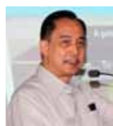
WILLIAM D. DAR