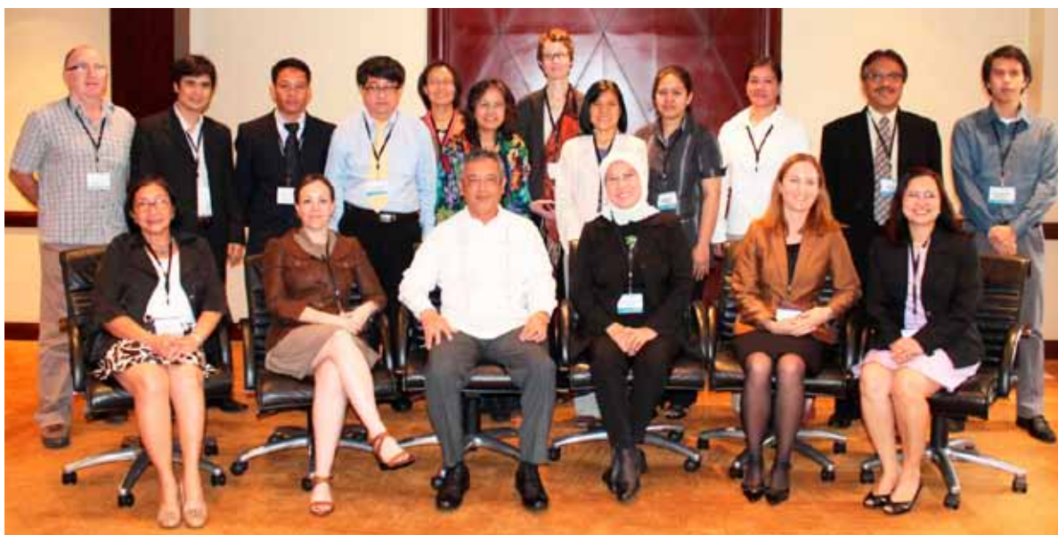
Participants and organizers of the FAO Outreach Event on Institutional Support for Inclusive Agribusiness and Agro-industries Development in Asia held on 6-7 November 2012 in Manila, Philippines.

The presenters and panelists included representatives from the FAO-AGS and various institutions from five Southeast Asian countries. Indonesian Center for Agriculture Socioeconomic and Policy Studies (ICASEPS) and Center for Agrifood Policy and Agribusiness Studies (CAPAS), Padjadjaran University, Indonesia; Institute of Agricultural and Food Policy Studies, Universiti Putra Malaysia; Philippines Center for Food and Agribusiness, University of Asia and the Pacific, Nueva Vizcaya Agricultural Terminal, Incorporated (NVAT), and Centre for Agriculture and Rural Development, Inc. Mutually Reinforcing Institutions (CARD MRI), all in the Philippines; Thailand Development Research Institute; and Institute of Policy and Strategy for Agriculture and Rural Development (IPSARD), Vietnam.