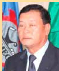
H.E. Kongsy Sengmany