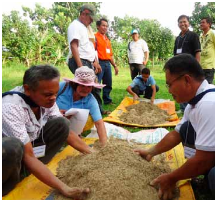
Participants learn how to mix feed rations for goats.

The five-module training course introduced the participants to different concepts and techniques in goat production and management. Topics discussed were farm structures and construction, animal feeding and nutrition, reproductive management and breeding, prevention and cure of common livestock diseases, and general husbandry practices. Hands-on activities in a goat farm complemented the lectures.