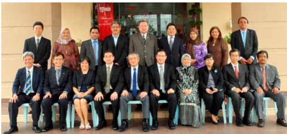
Participants of the 25 th University Consortium Executive Board Meeting held on 19-20 November 2012 at Universiti Putra Malaysia in Serdang, Selangor, Malaysia.