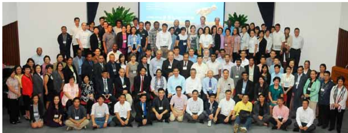
Participants and organizers of the International Conference on Climate Change Impacts and Adaptation for Food and Environmental Security held at SEARCA on 21-22 November 2012.

Climate Change Adaptation and Agriculture; (2) Institutional and Economic Aspects of Climate Change Impacts and Adaptation; (3) Systems and Tools for Analyzing Climate Change Impacts and Vulnerability; and (4) Regional and South-South Collaboration in Research and Development.