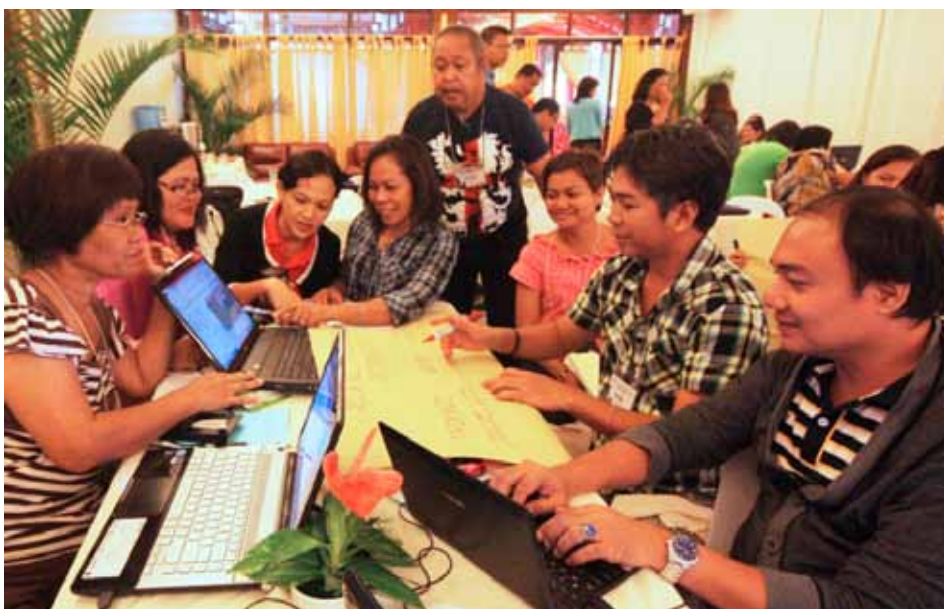
The training participants perform an exercise on logframe analysis.

Through exercises on logframe analysis, the participants learned how to use the tools needed in assessing their projects on a regular basis. This will