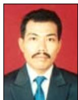
Munasik Indonesian Universitas Gadjah Mada

This study was designed to investigate the reproduction period, reproductive effort, and recruitment rate of coral Pocillopora damicornis in the southern and northern sides of Panjang Island, Central Java, Indonesia.