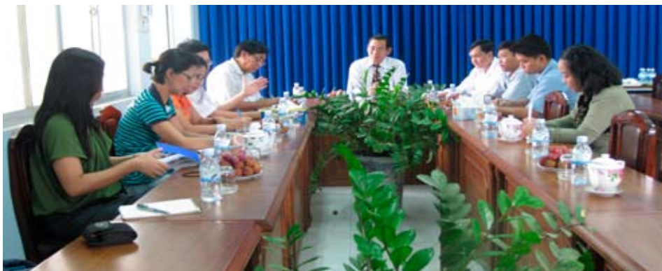
Members of the team (left side) that visited Vietnam discuss with officials of the Ho Chi Minh City Farmers' Association the policy and institutional environment for technology transfer and commercialization in the country's agriculture sector.