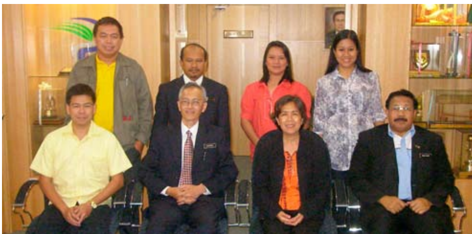
Officials of Farmer's Organization Authority in Malaysia welcome the Philippine Delegation before discussing their technology transfer and commercialization practices.