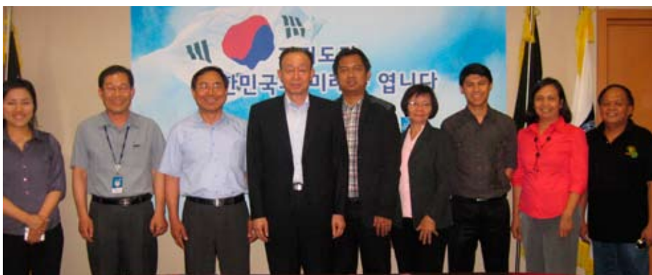
The Philippine delegation together with officials of the Research and Development Association (RDA) of Korea discussed the initiatives being undertaken by the different sectors for the improvement of their agricultural technologies.