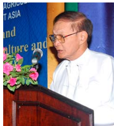
H.E. U Ohn Myint, Deputy Minister of Agriculture and Irrigation, Myanmar, welcomes the participants of the Eighth Policy Roundtable in Mandalay, Myanmar.

SEARCA has been conducting the Policy Roundtable Series since 2004 in response to the need to strengthen human resource capabilities of CLMV in dealing with emerging issues in agriculture and related fields through technical cooperation among developing countries in Southeast Asia. (CSZ Cabrera)