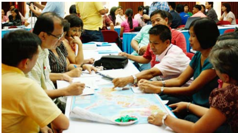
Participants discuss their capsule proposal during the workshop in the Second Training Course on Responding to Climate Change through Research and Development in Agriculture held on 15-18 June 2010 at SEARCA.