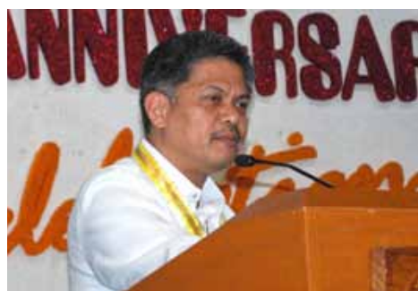
H. E. Armin A. Luistro, Secretary of Education, Philippines, keynotes the event.