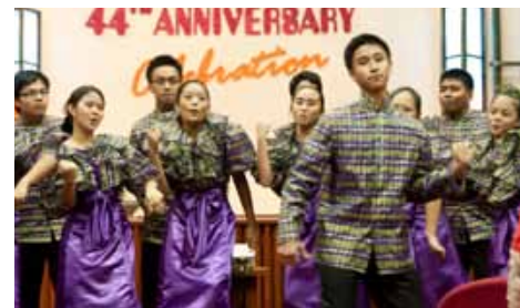
The UP Rural High School Choir charms the guests with their rendition of contemporary Filipino folk songs.