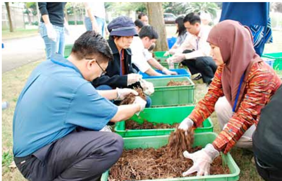
Participants separate wet rice straw (agro-waste) for use as basic raw material for mushroom cultivation.

SEARCA organized a Training Course on Edible Mushroom Production for Asian Farmers and Entrepreneurs in partnership with the Food and Fertilizer Technology Center for the Asian and Pacific Region (FFTC), Taiwan Agricultural Research Institute (TARI), and the Asia Pacific Association of Agricultural Institutions (APAARI). The training was held on 21-27 November 2010 in Taichung, Taiwan, Republic of China with support from the Council of Agriculture (COA) of Taiwan.