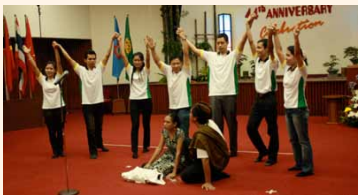
SEARCA scholars perform a special number that conveys unity and harmony among nations to address poverty during the afternoon program of the anniversary, which was an intimate affair that encouraged fellowship among SEARCA staff and scholars.