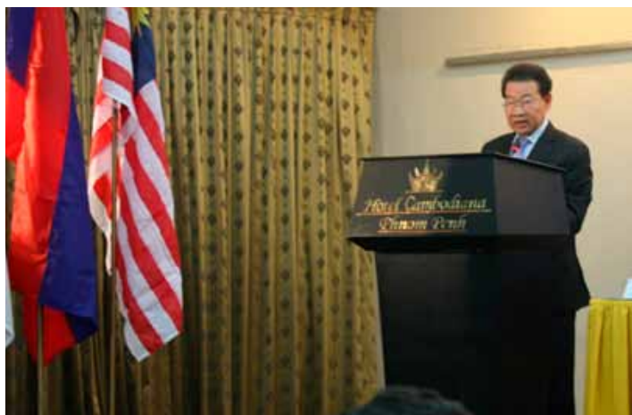
H. E. Chan Sarun, Minister of Agriculture, Forestry and Fisheries, Cambodia, delivered the keynote address.