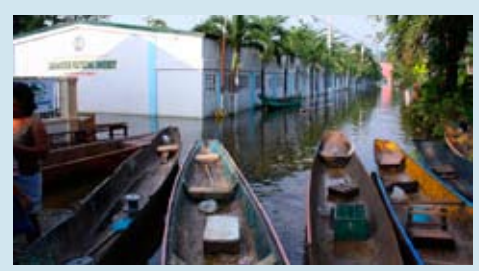
The Laguna State Polytechnic University was one of the hardest hit schools in Los Baños. Students and teachers had to use small boats to get to the place after the storm.