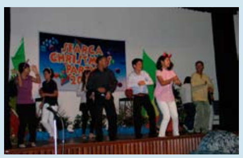
SEARCA scholars perform a Christmas-themed dance number