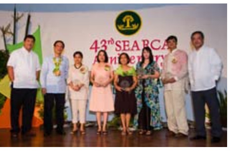
The SEARCA Loyalty Awardees of FY 2008/2009.