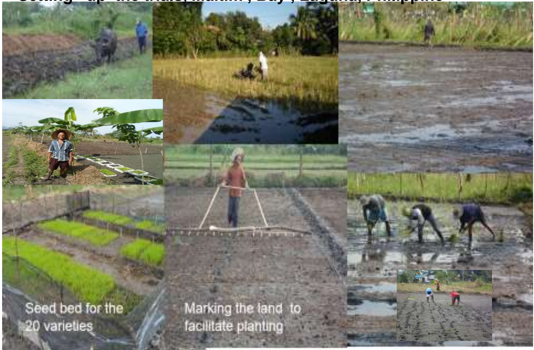
Fig.1. Crop establishment from land, seedlings preparation, marking prepared land to facilitate planting at 1 seedling/hill.