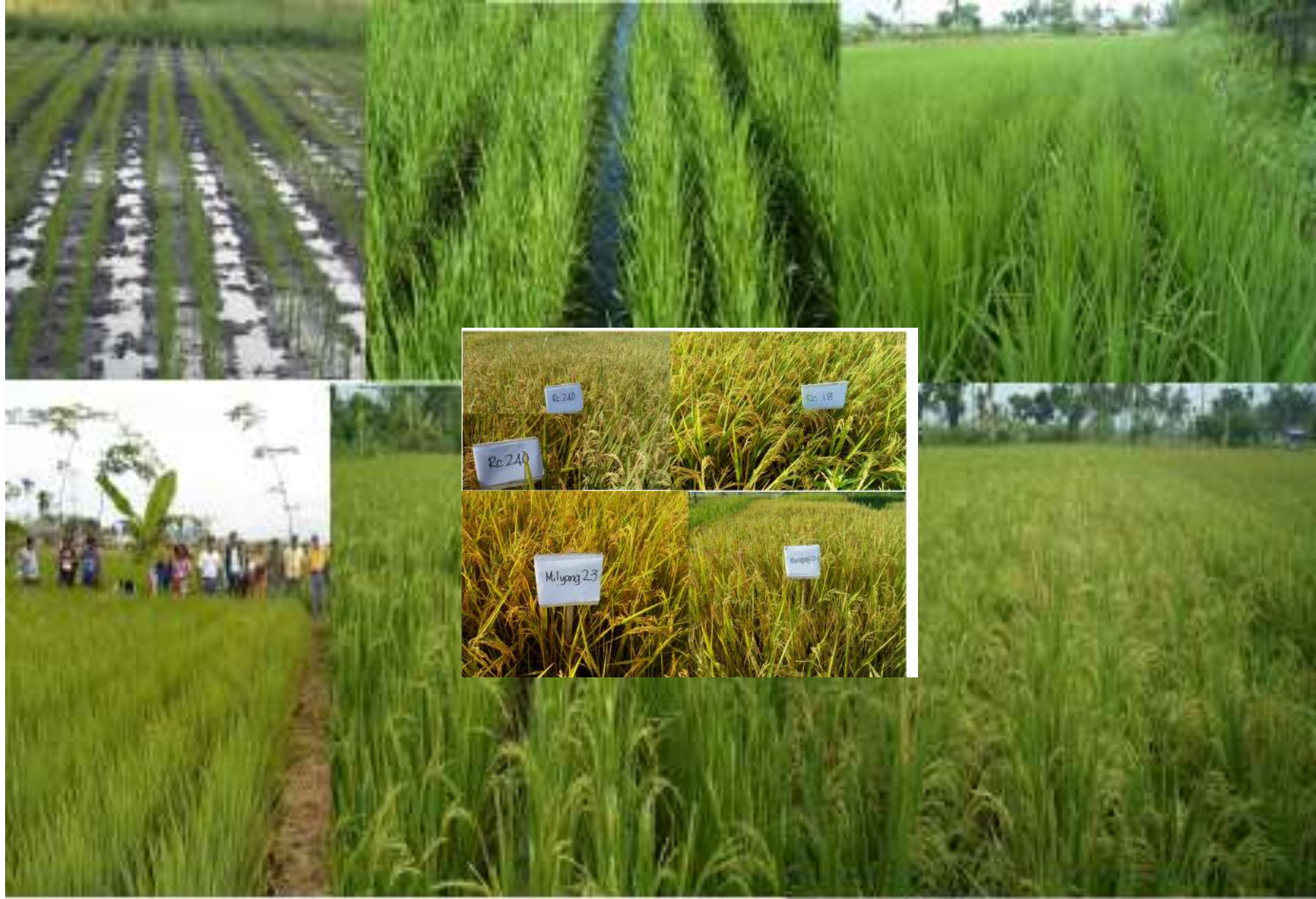
Fig.2. The double row planting pattern (20x10cm—40cm) at various growth stages.