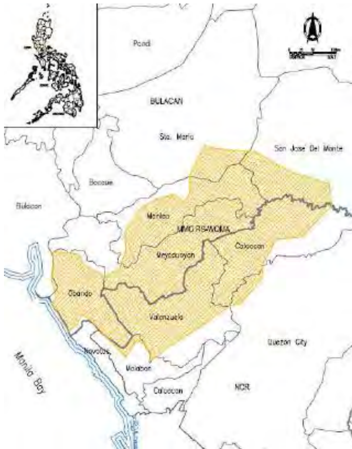
Location map of MMORS (David, 2011)