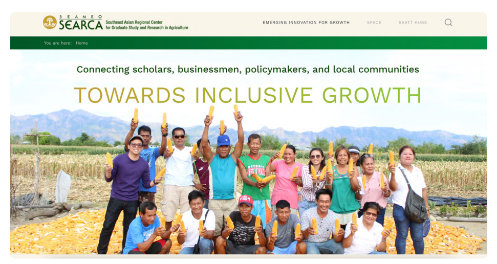
The SPACE platform is now accessible via https://space.searca.org/

In a recent outreach initiative, 60 emails were sent to a carefully curated list of experts, inviting them to join SPACE's growing pool of professionals. Over 25 experts, representing a diverse range of fields, have already expressed interest in joining this dynamic network. By becoming part of SPACE, these experts are contributing to a vibrant ecosystem of knowledge exchange and partnerships that seek to revolutionize agriculture across Southeast Asia.