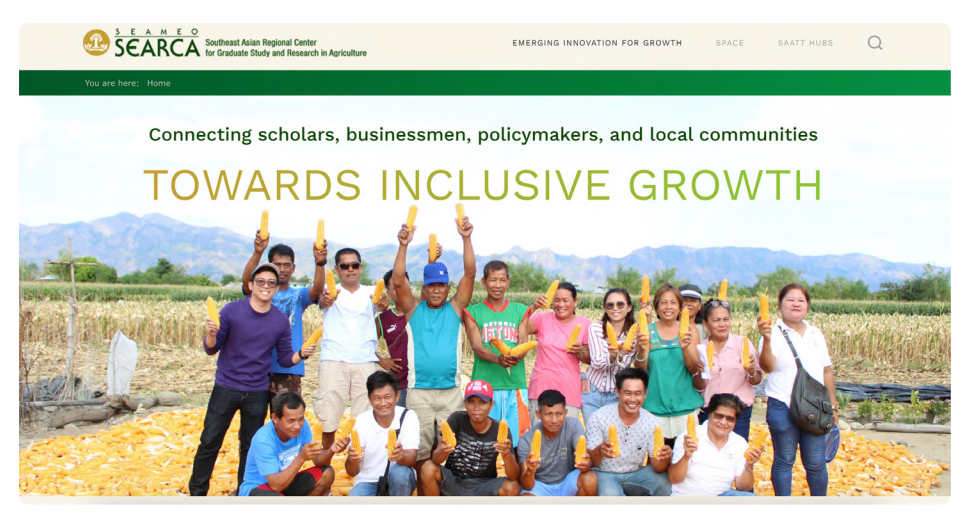
The SPACE platform is now accessible via https://space.searca.org/

In a recent outreach initiative, 60 emails were sent to a carefully curated list of experts, inviting them to join SPACE's growing pool of professionals. Over 25 experts, representing a diverse range of fields, have already expressed interest in joining this dynamic network. By becoming part of SPACE, these experts are contributing to a vibrant ecosystem of knowledge exchange and partnerships that seek to revolutionize agriculture across Southeast Asia.