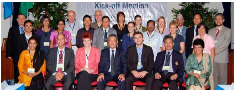
Participants of the EXPERTS Kick-off Meeting organized and hosted by SEARCA.

Spain was also represented at the Kick-off Meeting of the European Union-funded Exchange by Promoting Quality Education, Research and Training in South and Southeast Asia (EXPERTS) held in October 2010, which was organized and hosted by SEARCA. EXPERTS promoted European Higher Education System in South and Southeast Asian countries. It also sought to enhance the attractiveness of European higher education system in the region and increase the compatibility of higher education systems in Europe and Asia.