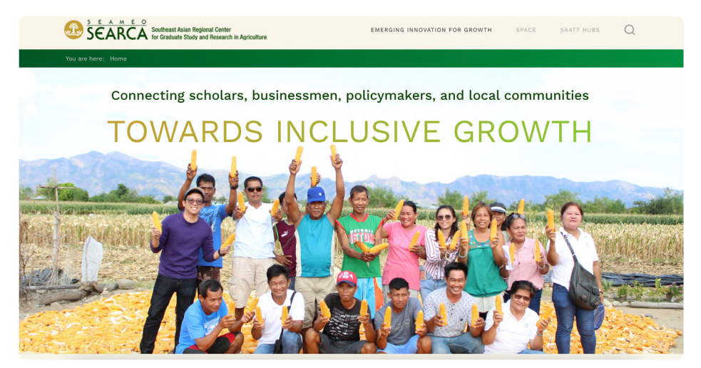
The SPACE platform is now accessible via https://space.searca.org/ With the participation of leading researchers, technology innovators, policymakers, and community leaders, the platform offers a unique space where cutting-edge ideas and practices can be shared to accelerate the adoption of Agri 4.0 solutions. Through its expert pool, SPACE facilitates collaborations that address key challenges in agriculture, from increasing productivity and food security to implementing sustainable practices and advanced technologies.

In a recent outreach initiative, 60 emails were sent to a carefully curated list of experts, inviting them to join SPACE's growing pool of professionals. Over 25 experts, representing a diverse range of fields, have already expressed interest in joining this dynamic network. By becoming part of SPACE, these experts are contributing to a vibrant ecosystem of knowledge exchange and partnerships that seek to revolutionize agriculture across Southeast Asia.