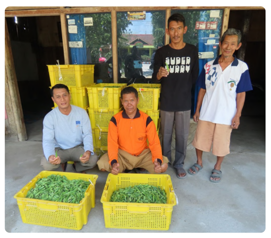
Some of the okra farmers benefitted by DAKOTA in Indonesia.

By facilitating two open innovation and knowledge exchanges in 2023, EIGD institutionalized partnership and collaboration among parties towards a synergistic innovation ecosystem and knowledge exchange and strengthened innovative and entrepreneurial mindsets.