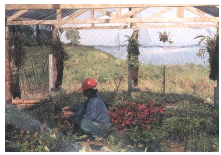
The newly constructed nursery where BRP researchers and local research partners propagate economically important plants.

A study conducted earlier by a team of BRP researchers on the participatory inventory and assessment of the plant resources in Barangays Mansawan, Gandawan, and Lake Duminagat of Don Victoriano, Misamis Occidental listed 2 endangered, 71 endemic, 11 rare, and 171 economically important species, which can be tapped as source of food, medicine, raw materials for handicraft making, and as ornamentals, among others. When these results were presented to the community, a possible livelihood project that would also serve as a strategy in conserving the remaining biodiversity in Mt. Malindang was identified. Some members of the community