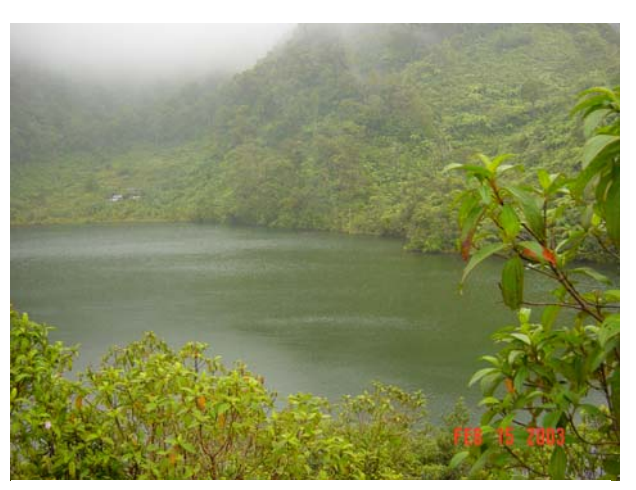
The sacred Lake Duminagat.