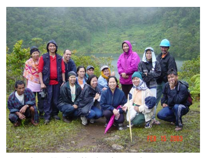
Researchers, NSS staff, and local residents pose for a group picture in Lake Duminagat.