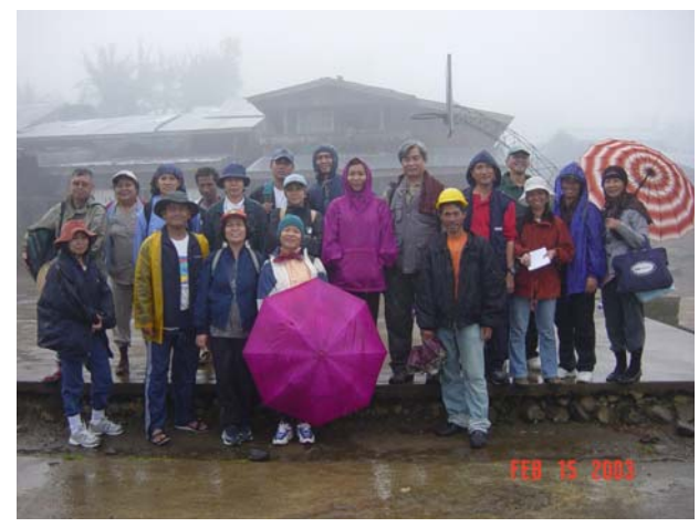
The group pose for a picture in Barangay Mansawan.