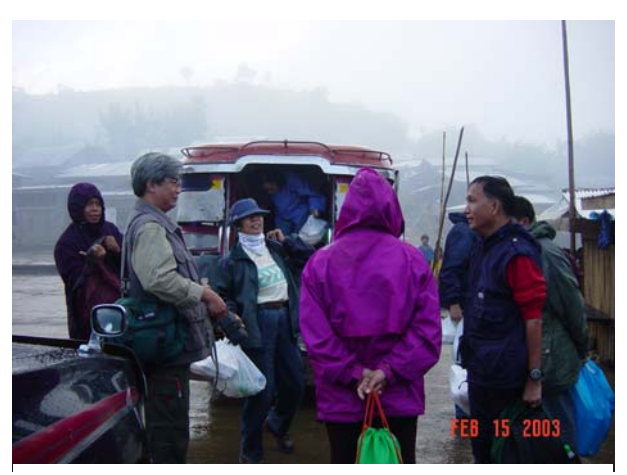
{\it The\ group's\ arrival\ in\ Barangay\ Mansawan}.