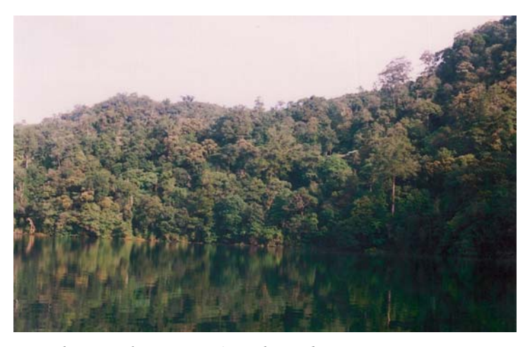
View showing Lake Duminagat's northern side.

Lake Duminagat has been identified as of great interest among the freshwater ecosystems in Mt. Malindang. It is the water source for irrigation, for industrial and domestic water supply as well as for food for the province of Misamis Occidental and some municipalities of Zamboanga del Sur and Zamboanga del Norte. It is also biologically significant as a water source for flora and fauna and as an area of high species diversity. In cultural terms, it is a sacred place for the Subanen people. This project aims to: (1) characterize the local communities surrounding Lake Duminagat in terms of their cultural and socio-economic profile, perception, beliefs and practices about the lake, and utilization of the lake and its resources. and (2) make an inventory of the lake's biodiversity, and assess and measure the lake's geophysicochemical characteristics. The researchers will use participatory methods, and both participatory and standard methods, respectively to obtain the data for the study. The researchers and local communities will work together to