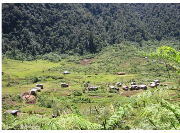
Panoramic view of Brgy. Lake Duminagat, one of the upland communities in Mt. Malindang.

DENR-Region X, LGUs, Indigenous People (IPs), Protected Areas Management Board (PAMB), DA, AusAID-Philippine-Australian Programme for Local Sustainability (PALS), National Commission on Indigenous People (NCIP), CARE-Agencies Working for Ecological Sustainability of Mt. Malindang's Environs (AWESOME), Department of Agrarian Reform (DAR)