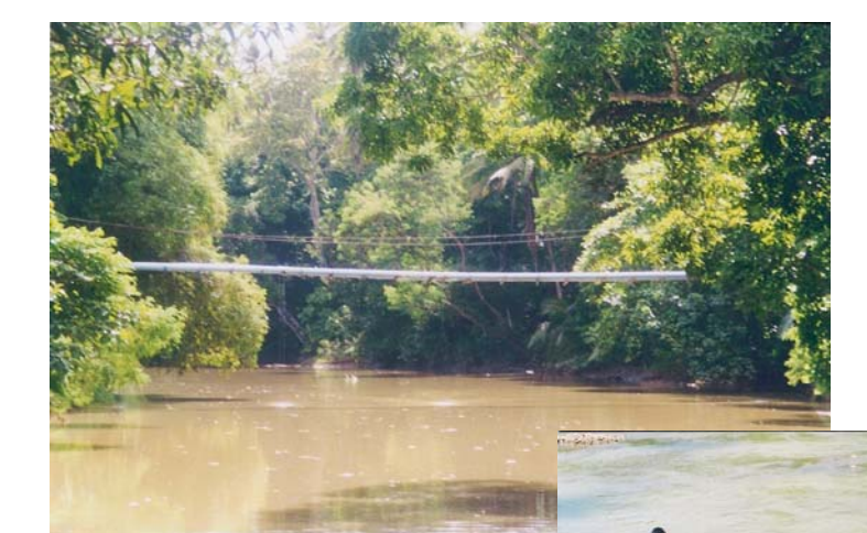
Langaran River in Tipolo, Plaridel.

This project focuses on Langaran River, which plays an important role in the upland-lowland interactions in the Mt. Malindang landscape. However, the river is literally disturbed and exploited. There are three dams along the river; the water is used to irrigate vast rice fields; and massive quarrying occurs from upstream to downstream. To bring about ecological and conservation awareness to the communities in the research area, the researchers will conduct a participatory inventory of vascular flora and fauna, and assessment of habitat status. The community will be involved in the research process to enable them to understand the nature and value of biodiversity for them to manage the Langaran River on a sustainable basis. The data that will be obtained will