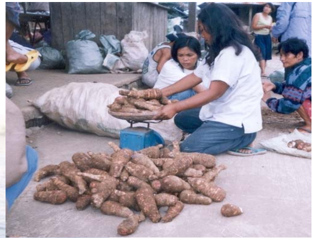
Men dominate in fishing while women engage in the marketing of produce.