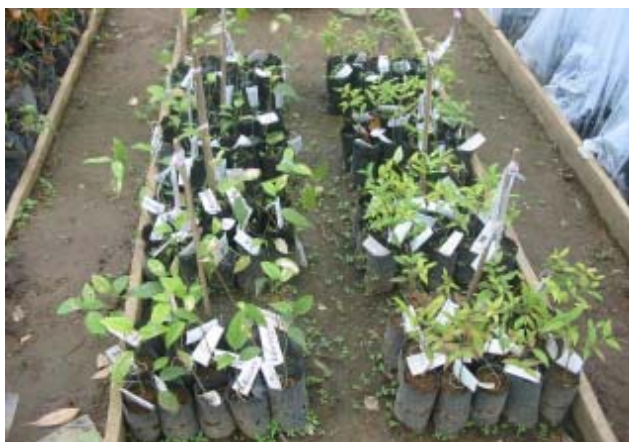
Agathis philippinensis and Cinnamomum mercadoi planted in various potting media.

Another barangay resolution has been drafted prohibiting the pasturing or grazing of animals along the roads and trails where the wildlings have been outplanted. There is also a plan by the Barangay Council to make the nursery into an income-generating project for the community by requiring visitors or tourists to buy the wildlings from the nursery and plant them along the trails leading to the forest. The researchers recommended the creation of a management team composed of four local researchers and other members of the community who have been closely involved in the project to handle and supervise the nursery and its operation. ▪