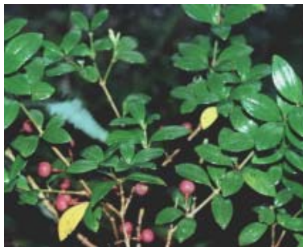
Medinilla malindangensis , found only in Mt. Malindang.