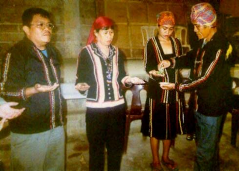
The Subanun perform rituals to invoke the spirits for various purposes: in seeking cure for illness and restoration of one's health or protection against harm brought by evil spirits, in appealing for a successful marriage, in supplication for achieving the goals of certain important events that necessitate the blessing of the spirits, and in thanksgiving for bountiful harvest or for good fortune.

All is not lost for the ecosystems of Mt. Malindang where the Subanun communities are situated. Some community-based and functional organizations in the research sites have expressed a deep sense of environmental concern, as well as the desire for environmental rehabilitation, restoration of cultural dynamism, and identification of elements of Subanun indigenous knowledge systems that are vital in community development interventions. Furthermore, relevant community-based organizations have declared their intention to use BRP studies in the crafting of proposals for development interventions, including programs for biodiversity conservation.